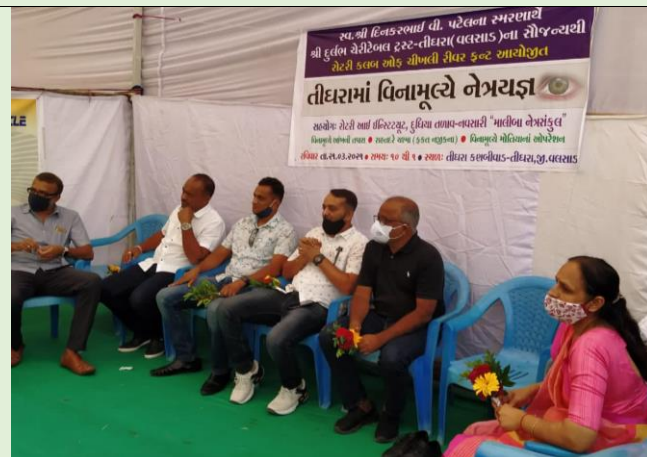
ROTARY CLUB OF CHIKHLI RIVER FRONT ORGANISED GENERAL MEDICAL CAMP IN ASSOCIATION WITH ALIPORE HOSPITAL AND ROTARY EYE INSTITUTE.