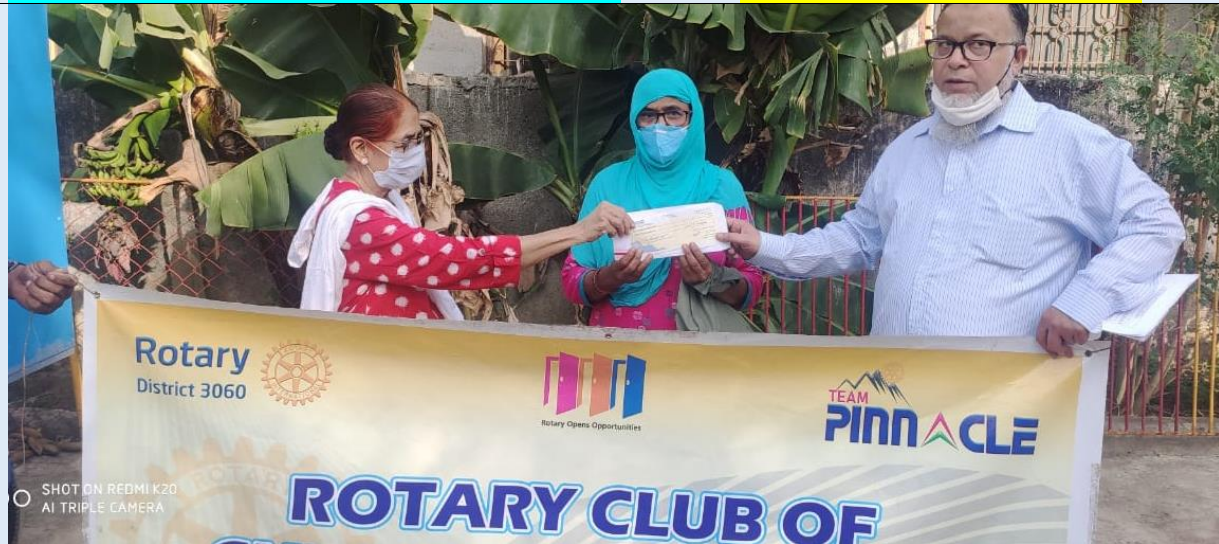
COUPLE GETS HAND LARRY CART

LADY GETS CHEQUE FOR HER DOOR- TO-DOOR DELIVERY OF HOME MADE FOODS & SPICES