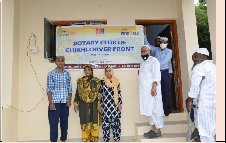
HANDING OVER THE HOUSE KEYS TO THE PARALYTIC BENEFICIARY FAMILY IN DABELHEL