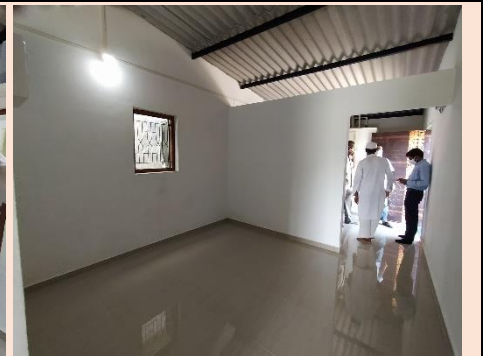
BAMANWEL HOUSING PROJECT