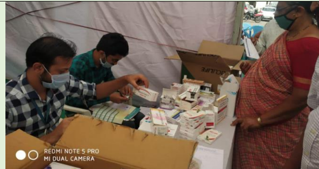
FREE MEDICINE DISTRIBUTION