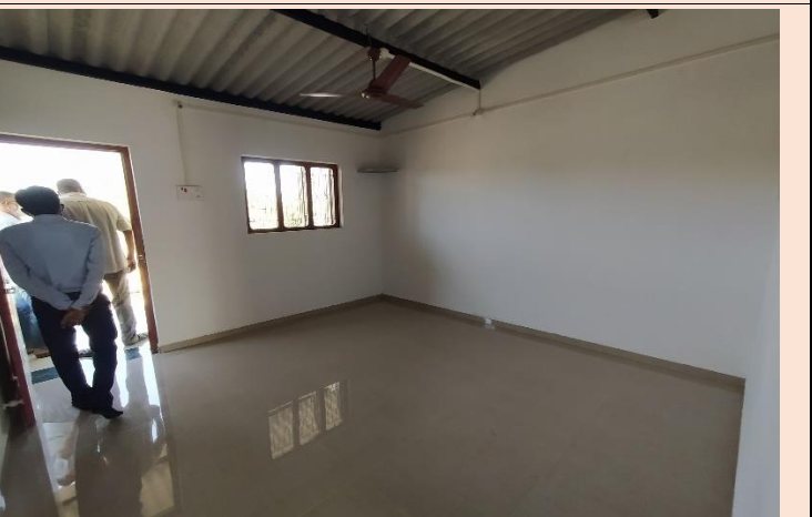
ADHARPEER HOMELESS WIDOW HOUSING PROJECT