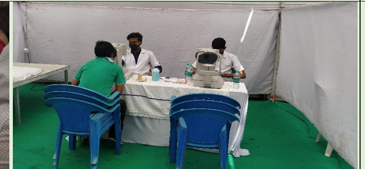
EYE TESTS UNDER PROGRESS